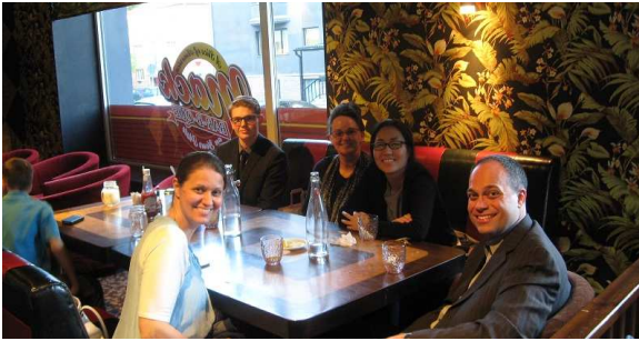
Eating American BBQ dinner at Mack's with wonderful people after a good service!

Living for Jesus is the best thing, the most exciting thing you could ever do.