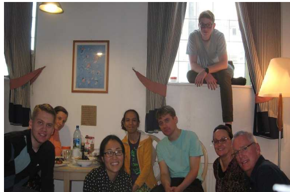
Thursday night home Bible study and dinner