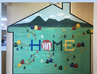
The children doing their kite project for a fun activity on the windy days.