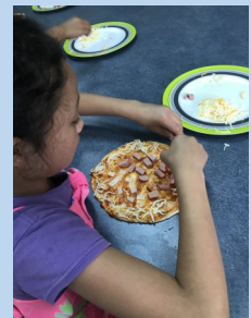
The kids learned how to make their own pizzas!