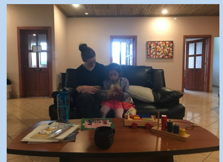
This little one loves reading time!