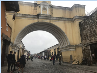
We went to visit Antigua, which is the location of ruins of Spanish architecture here in Guatemala. I tried chocolate tea and walked through the cobblestone streets.