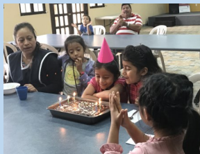
Celebrating her birthday!