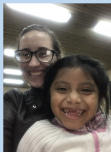
This precious girl was just adopted!