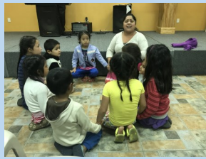
The kids praying together at one of their child focused services.