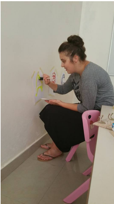
Left: Painting the wall at the preschool. Right: An example of the one of the walls we painted.