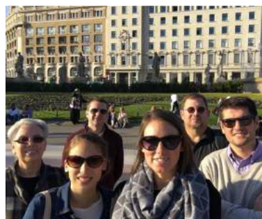
WE WERE EXCITED TO SHARE BARCELONA WITH OUR FAMILY FOR THANKSGIVING