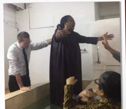
ONE OF THIS MONTH’S BAPTISMS IN BARCELONA!