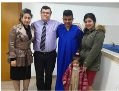
THE DAUGHTER WORK IN MANRESA IS GROWING WITH 2 BAPTIZED IN MARCH