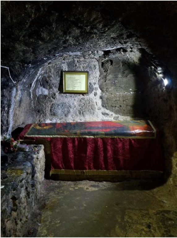
The tomb of Barnabas.