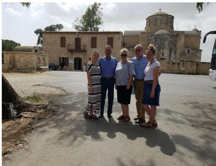
At the Charity Shop in Pervolia!