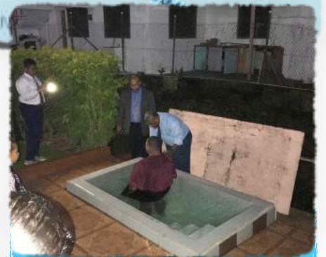
Baptism in Jesus precious name at First International UPC