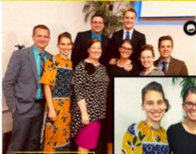
A.T.M. Workers in Spain