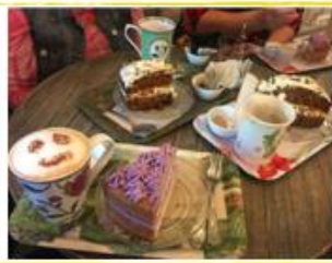
Missionary wives tea date!