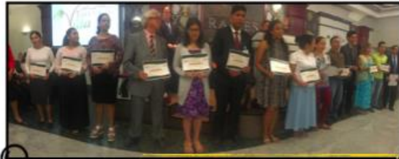
Spanish Church New Members

At the beginning of July we had more saints in the church complete the New Members course. We offer the course every 4 months and it always amazes me how many graduates we have by the end of it. Revival is here in Spain!