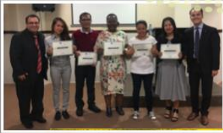
English Church New Members

At the beginning of July we had more saints in the church complete the New Members course. We offer the course every 4 months and it always amazes me how many graduates we have by the end of it. Revival is here in Spain!