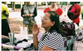
Service in the Park- The Pentecostals of El Prat