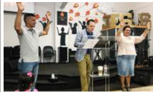
Leadership Meeting- Altar Working